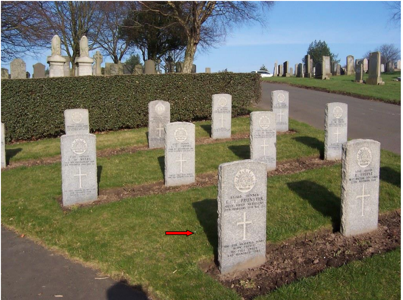
Some of the Australian Headstones in Western Necropolis Cemetery, Glasgow, Scotland

Gunner C. J. Prunster's headstone marked with red arrow