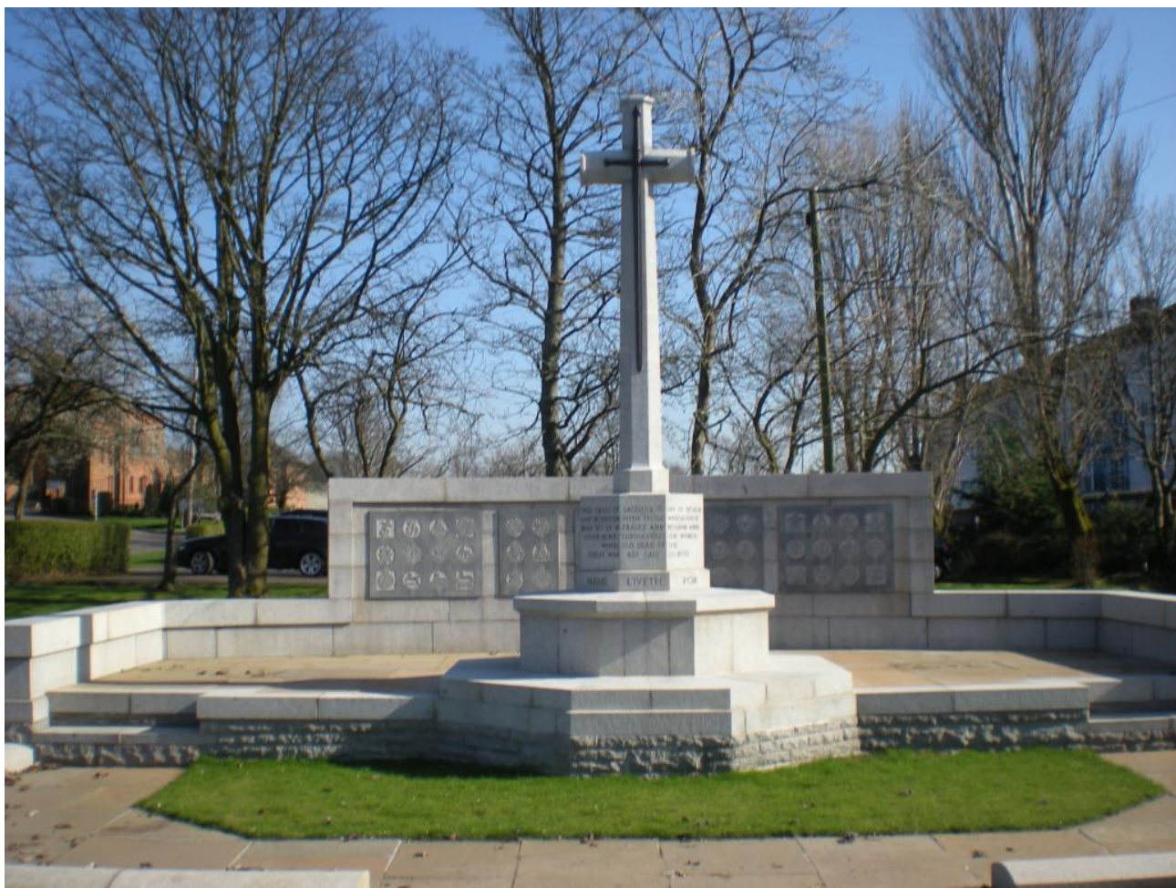
Cross of Sacrifice in Western Necropolis Cemetery, Glasgow, Scotland